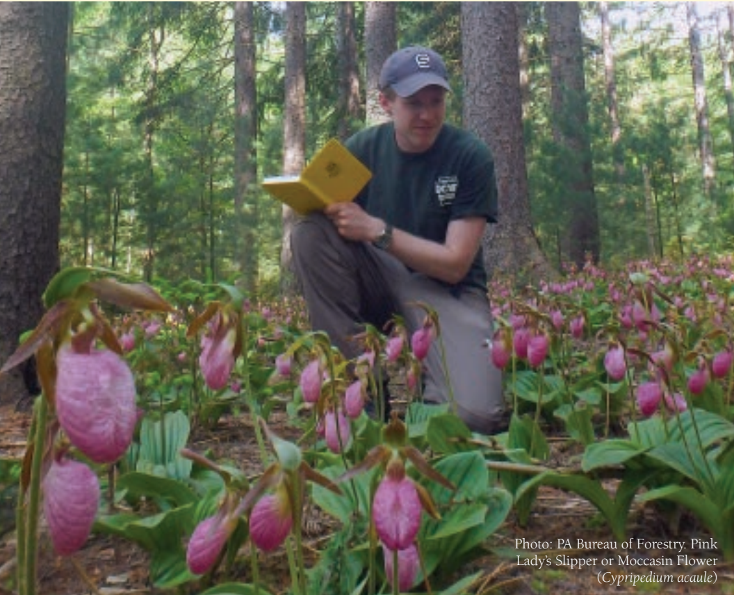
Pink Lady's Slipper or Moccasin Flower ( Cypripedium acaule )